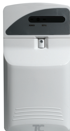
TC Pump LED 400695